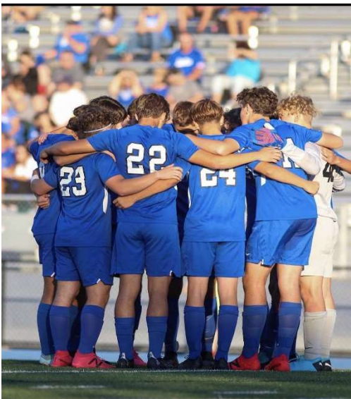
The boys soccer team comes together during the game to show a team effort.